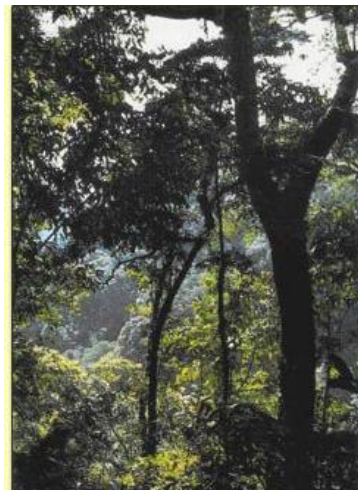
Mabira Forest www.pearlof africa.nl/Forrest1.jpg