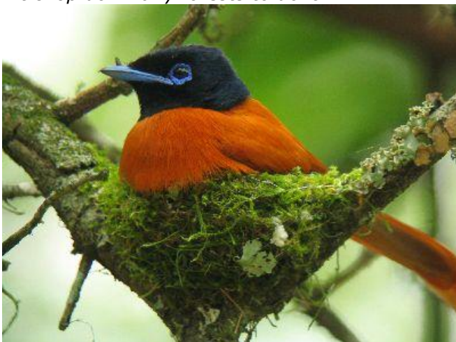
Paradise Fly Catcher www.credit-uganda.com/mabira.htm

During my googling I came across another project that may be good. Instead of using sugar cane the Ugandan Government is thinking about making fuel from a plant called cassava. Cassava is a plant that provides food for many people and is used a lot in Uganda but recently disease has killed a lot of the plants. This new plan would try to make a new cassava plant that gives more food and can be used for bio-fuel. If they can succeed in doing this I think it is a very good idea provided they don't chop down any forests to do it.